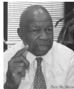
Congressman Elijah E. Cummings, Chair of Coast Guard and Maritime Transportation Subcommittee.

From TWIC and AIS to ballast water, vessel air pollution and maritime salvage, it is critical that the industry and those who work in it keep their antenna up for new bills and rules. ☆